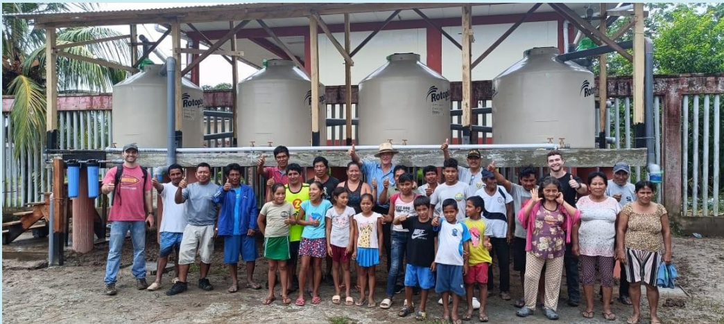
The community of Yucuruchi now has potable water! February 2024