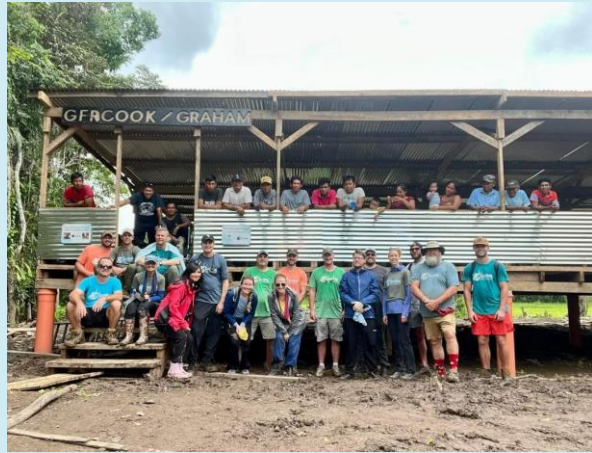
Finished community center in the village of Cas Ila. Medical clinics, January 2024.