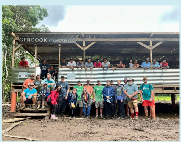
Finished community center in the village of Cas IIa. Medical clinics, January 2024.