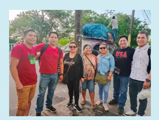
Thank you, Amazon Promise team in Iquitos!